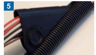
5 ...through corrugated tube.