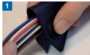
1 Push tool over cables