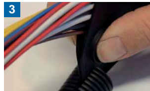
3 slide tip of tool into corrugated tube.