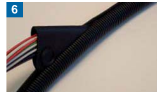
6 See figure 4-6.